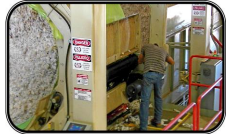
#3 Cut Wrap Thru Slot