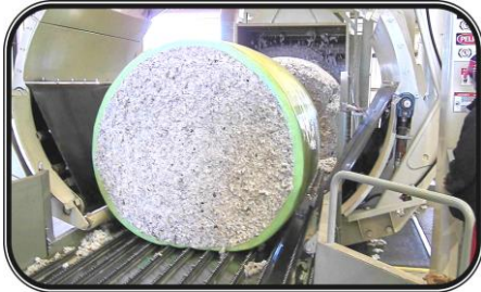
#1 Arms Open/Convey Module In

U.S. PATENT APPROVED 9/21/11 14 CLAIMS AWARDED