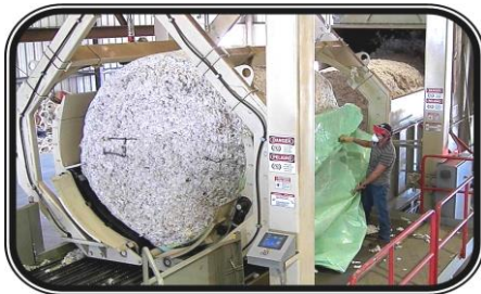
#4 Rotate/Remove Wrap