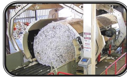
#5 Belts Tilt up to Convey Module Out