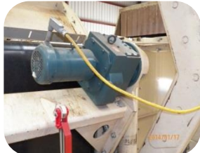
5 HP GEAR MOTOR BELT DRIVE