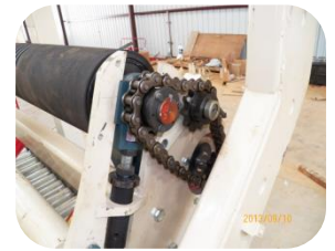
#120 HEAVY DUTY CHAIN & SPROCKET DRIVE (SHOWN WITHOUT GUARD)