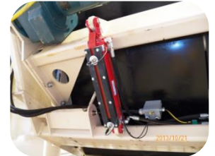
HEAVY DUTY PROX SWITCH MOUNTING SYSTEM