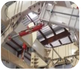
SAFETY HYDRAULIC CATCHER CYLINDERS