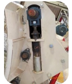
TENSIONER PREVENTS BELT OVERLOAD