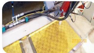
OSHA APPROVED SAFETY MATS