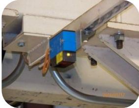
HIGH INTENSITY LASER SENSOR DETECTS MODULE POSITION