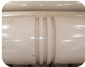
TRIPLE GROOVED BELT GUIDES