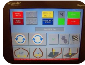
SIMPLIFIED TOUCH SCREEN CONTROLS