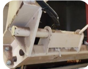
CRADLE SAFETY LOCK