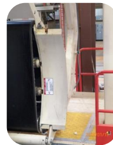
SIDE SHIELDS PREVENT COTTON SPILLAGE