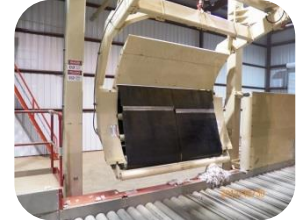
CRADLE IN LOCKED POSITION