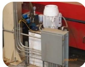
COMPACT 15 HP HYDRAULIC PUMPING UNIT