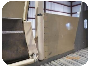
SQUEEZE ROLLERS FOR NARROW FEEDER BEDS