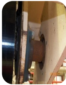
HEAVY DUTY BEARINGS